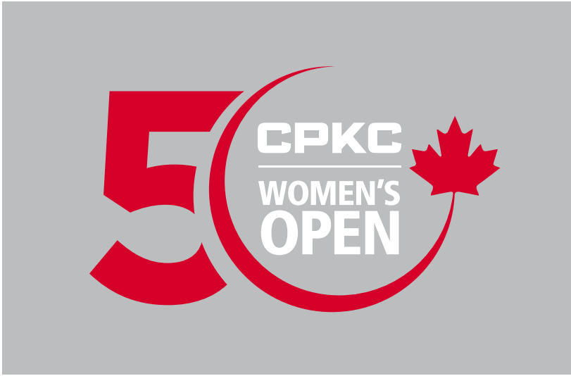
Reverse 4C - English