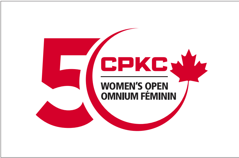
Standard 4C - Bilingual