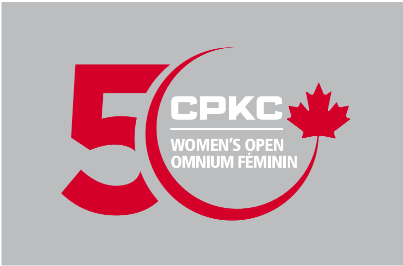
Reverse 4C - Bilingual