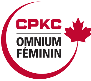
Stacked - French