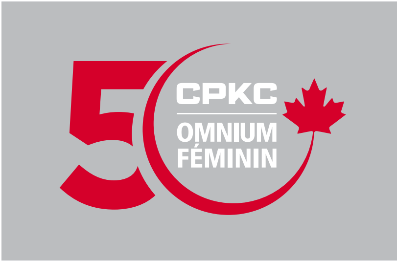
Reverse 4C - French