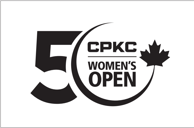
Standard 1C - English