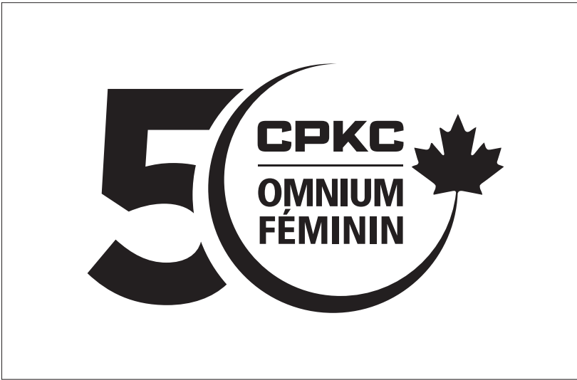
Standard 1C - French