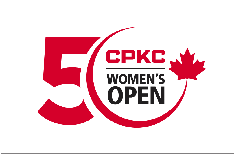
Standard 4C - English