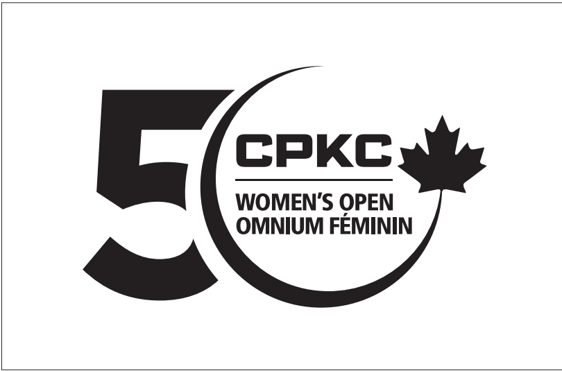
Standard 1C - Bilingual