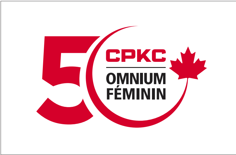
Standard 4C - French