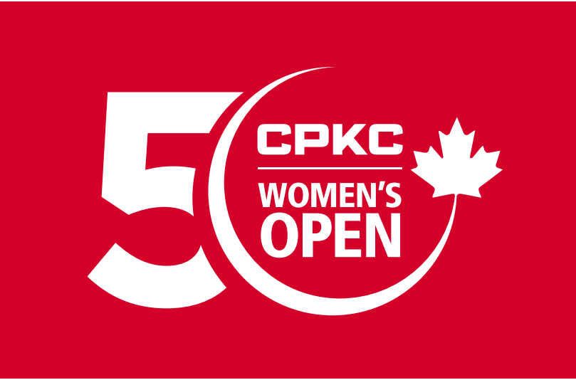
Reverse 1C - English