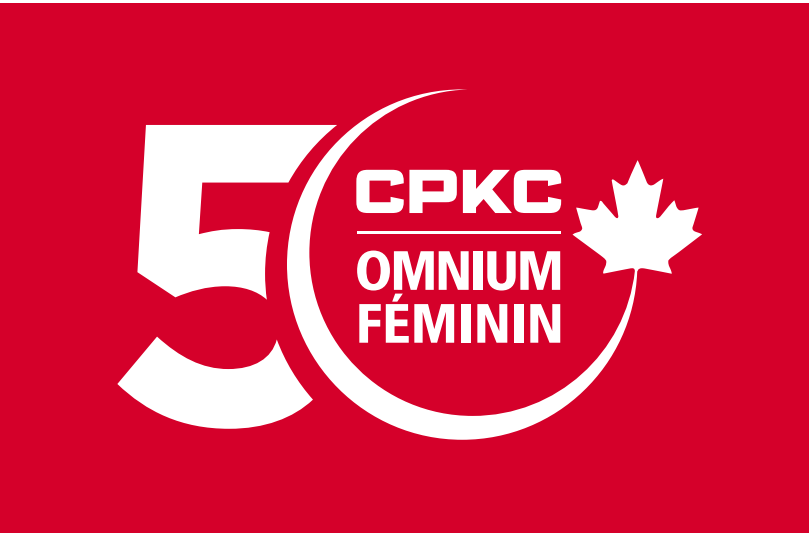
Reverse 1C - French