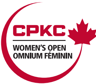
Stacked - Bilingual